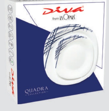
FULL PLATE SET 6 PCS