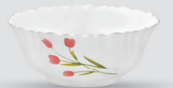
VEG BOWL 100 mm • 175 ml