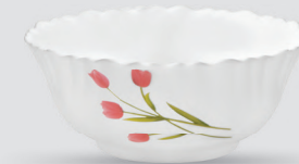
SOUP BOWL 115 mm • 270 ml