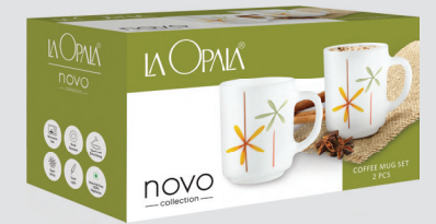
COFFEE MUG SET GRACE (M) 2 PCS