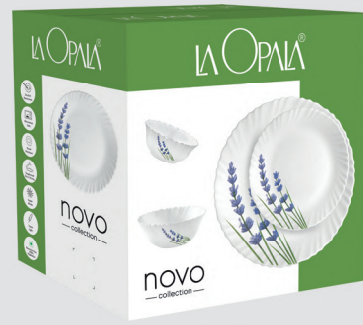
DINNER SET 12 PCS