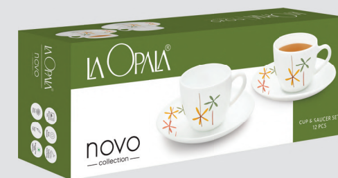
CUP & SAUCER SET LILY 12 PCS