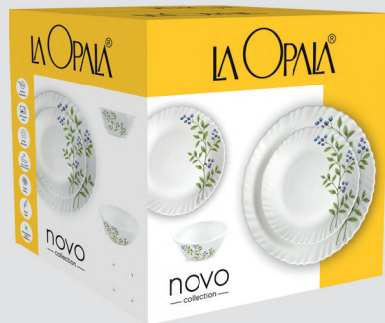
DINNER SET 23 PCS