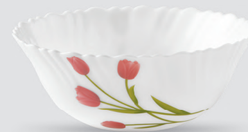
SERVING BOWL (S) 175 mm • 850 ml