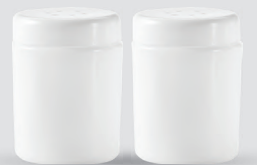
SALT & PEPPER POT