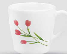
COFFEE MUG CLEO 150 ml