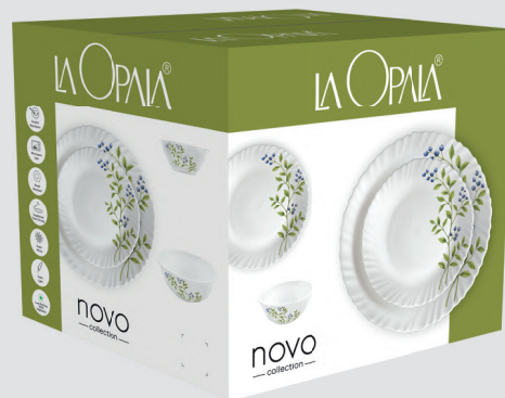
DINNER SET 46 PCS