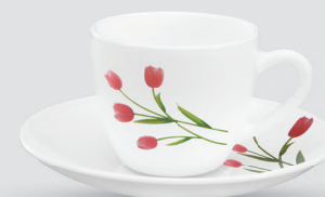
CUP & SAUCER LILY 150 ml