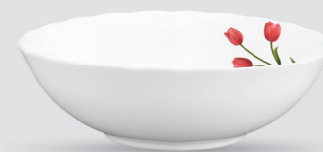
MULTIUTILITY BOWL 155 mm • 575 ml