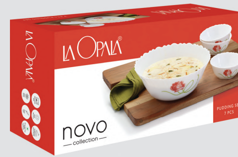
PUDDING SET 7 PCS