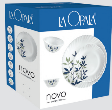
DINNER SET 20 PCS