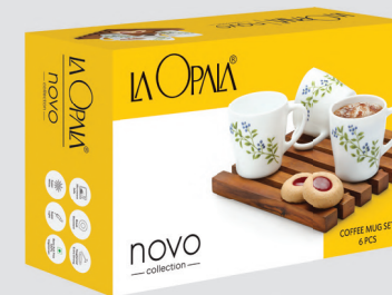
COFFEE MUG SET CLEO 6 PCS