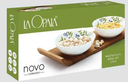
MULTIUTILITY BOWL SET 2 PCS