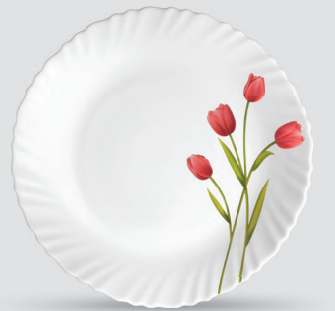
QUARTER PLATE 180 mm