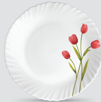
ROUND RICE PLATE 280 mm