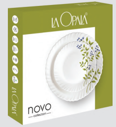
QUARTER PLATE SET 6 PCS