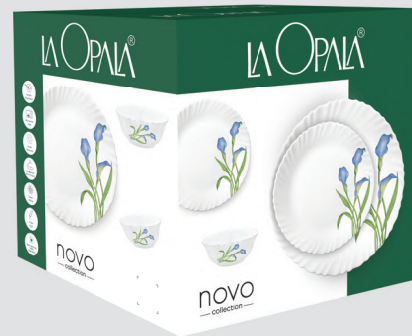
DINNER SET 29/35 PCS