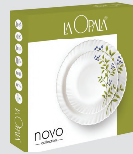
FULL PLATE SET 6 PCS