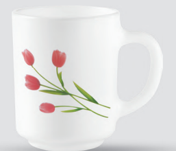
COFFEE MUG GRACE (M) 250 ml