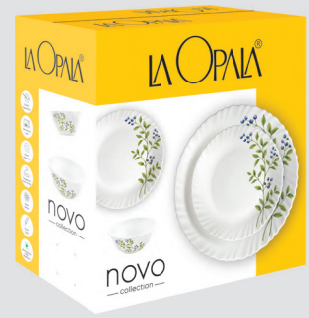
DINNER SET 6 PCS