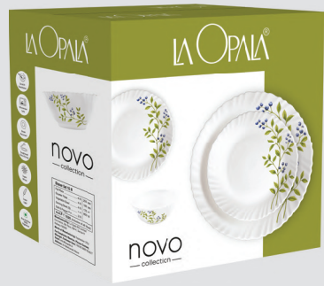
DINNER SET 15 PCS