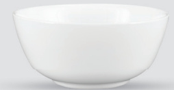
VEG BOWL 100 mm • 220 ml