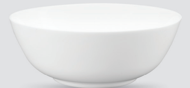
SERVING BOWL 203 mm • 1.58 L