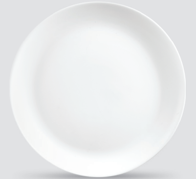
QUARTER PLATE 190 mm